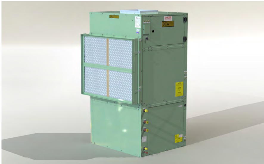
DCA 3300TV-WH POOL WATER HEATING UNIT

Sensible cooling capacities rated at 95F ambient