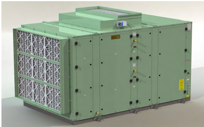
DCA 11000T AIR COOLED UNIT