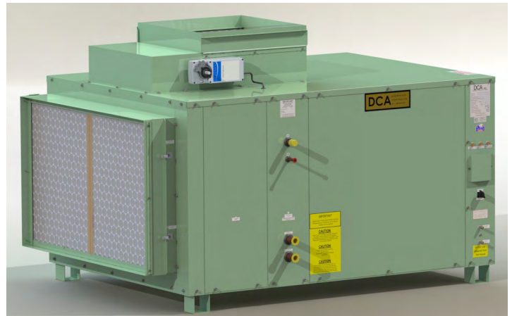
DCA 2500T-WH POOL WATER HEATING UNIT