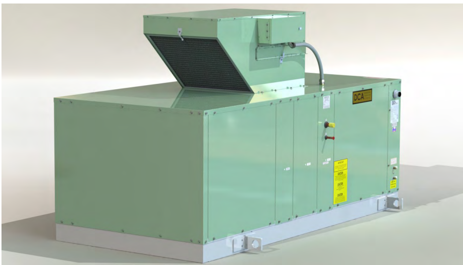
DCA 2500T AIR COOLED ROOF TOP UNIT WITH BOTTOM SUPPLY & RETURN

The best warranty in the industry, the highest quality components, built by American craftsmen, all at a competitive price, this is what we mean when we say, "Value Driven Quality, Built Here."